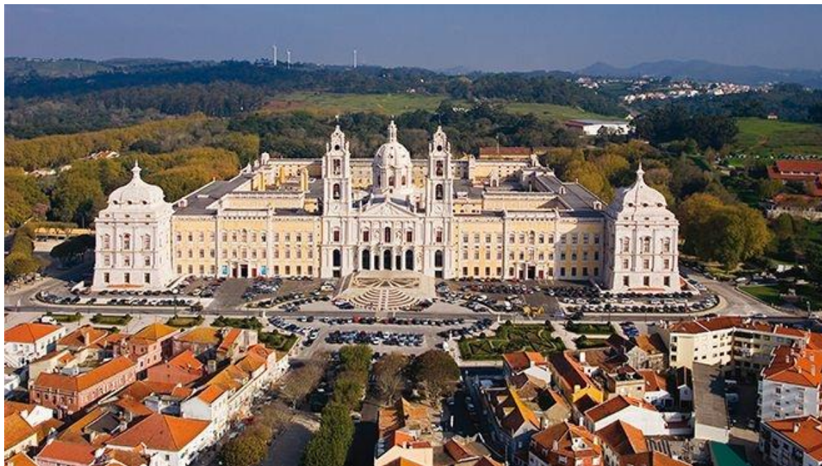
Maфра National Palace and Convent

1.30 pm – Farewell lunch in the cloisters of the convent, with entertainment 5.00 pm – End of the conference and return to the hotels