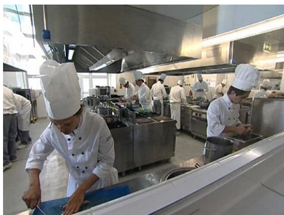
Exhibition of high-quality agri-food products