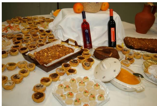
CEUCO Associations Enogastronomic Show