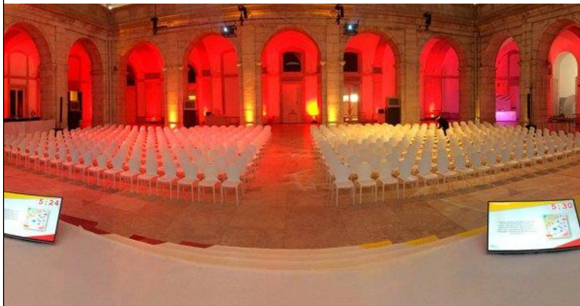
Páteo da Galé