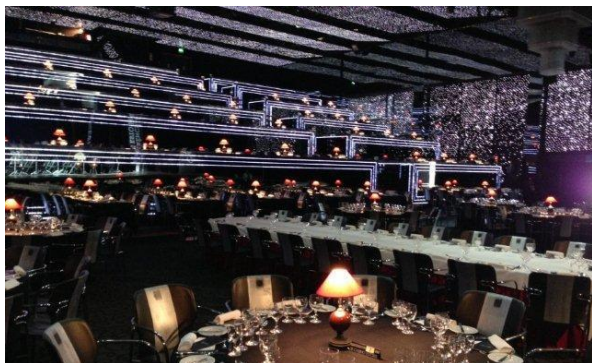
8.30 pm Gala Dinner at Páteo da Galé